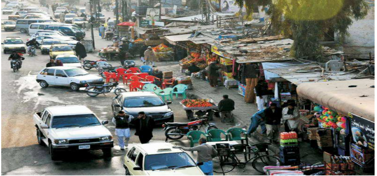
Pic. 1 : Road Traffic in Jaipur City

Jaipur has a total road network of around 1500 km. Approximately 34 per cent of the roads are two lane roads. Although 52% of the roads surveyed are 4 lane, parking and encroachments on carriageway has led to underutilization of the road capacity.